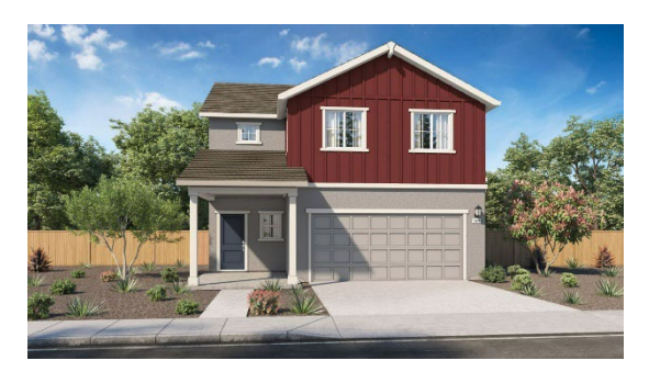
A - Farmhouse

886 PICO PLACE, CHICO, CA 95973 | DRHORTON.COM/SACRAMENTO