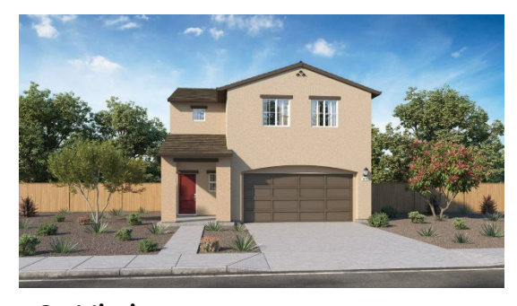
C - Mission